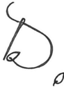
Lazy Daisy Stitch: